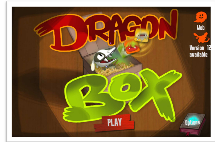
Figure 1. The title screen of DragonBox Algebra 5+